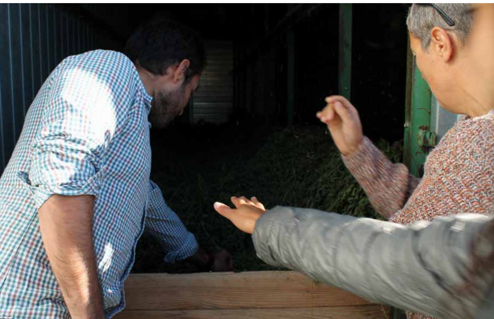
The preparation of Rosemary for drying by one of our partners of the SICA Bio-plantes in Alixan (26)