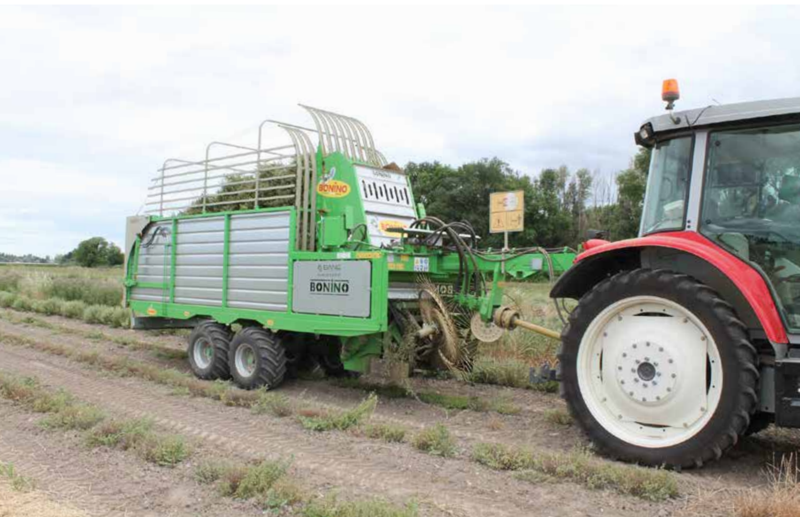
A field of Marjoram in full harvest by one of our partners of the SICA Bio-plantes in Chabeuil (26)